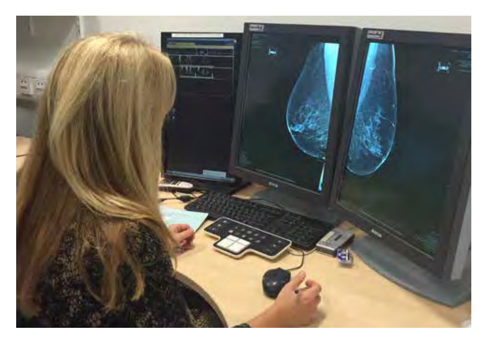
Checking mammogram images for signs of cancer